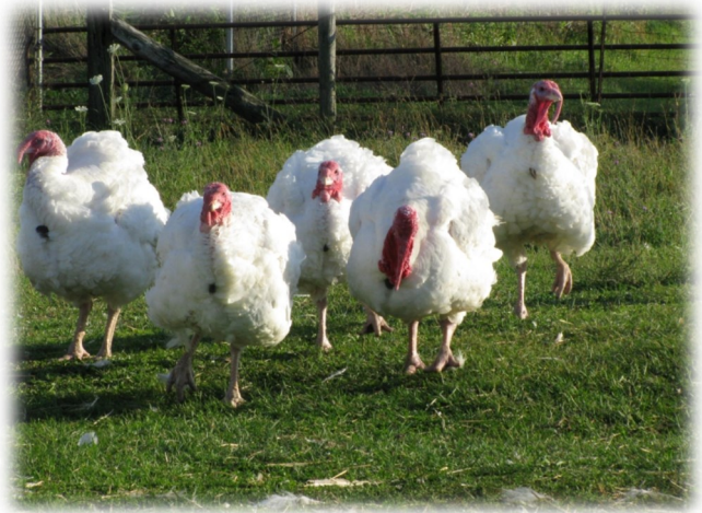
Turkeys on the run at Cornwell's Turkey Farm