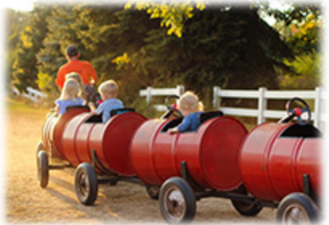
Pumpkin Train at Gull Meadow Farms, Richland