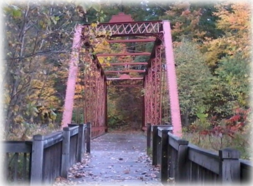
Historic Bridge Park, Battle Creek